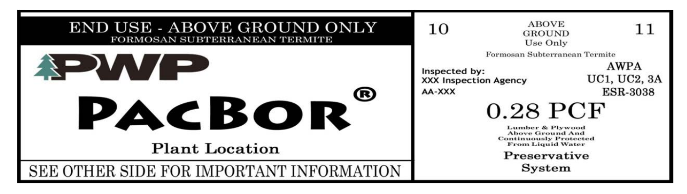
FIGURE 3—SAMPLE PRODUCT LABEL—AWPA UC1, UC2, UC3A FORMOSAN TERMITES

FIGURE 2—SAMPLE PRODUCT LABEL—APWA UC1, UC2