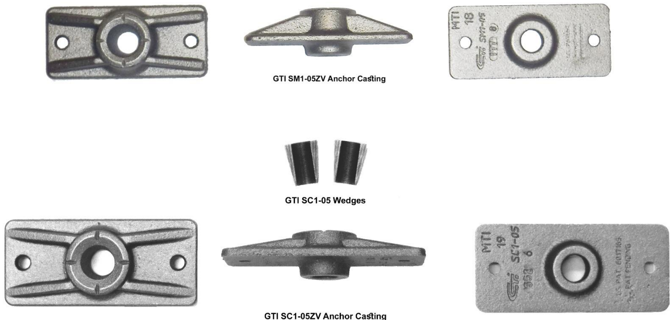
FIGURE 1—GTI ZERO VOID® POST-TENSIONING SYSTEM COMPONENTS